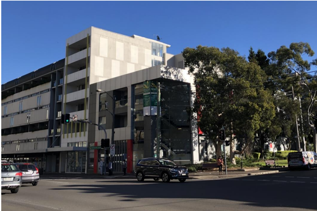
Figure 1: 108 Parramatta Road, Camperdown, viewed from the north-west